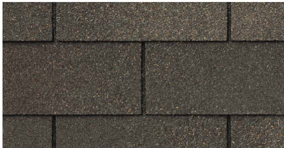
Weathered Wood (XT 25 , CT 20)

CertainTeed XT-25 Weathered Wood 3-Tab (25-year shingle). This shingle is the closest match to the shingle that was installed when the home was constructed by BCH.